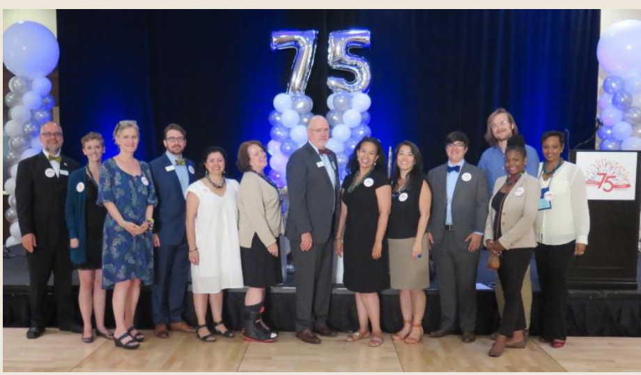
Episcopal Relief & Development staff gather at General Convention.