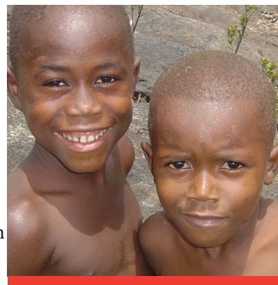
The children of Sierra Leone face continued hardships as their communities struggle to recover from the epidemic.

In undertaking this important responsibility, committee members are aided by our Pastors and Disasters Toolkit, a comprehensive guide developed by a working group of 12 global Church partners who worked tirelessly over the past three years. Utilizing the wisdom and hardearned experience of our partners, the Toolkit