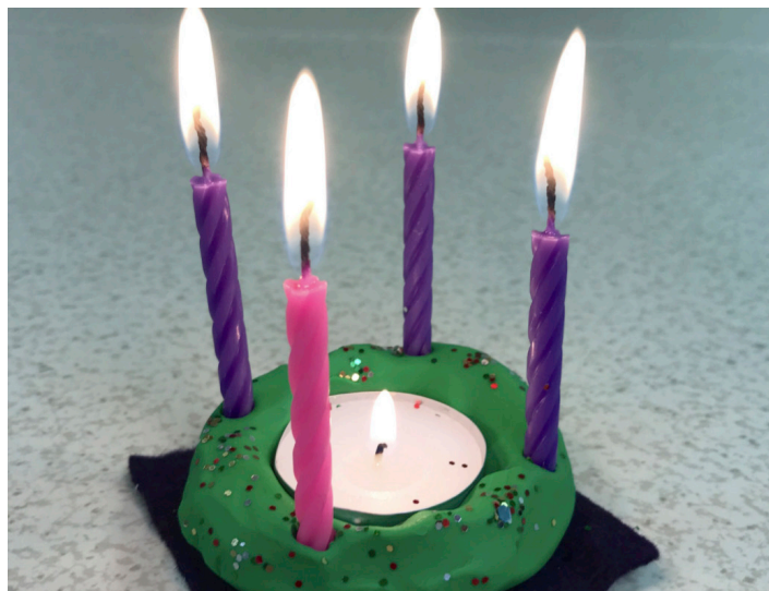
Based on the $0.99 Advent Wreath from Building Faith.

Stick the four candles into the wreath and decorate with holly, berries or gems.