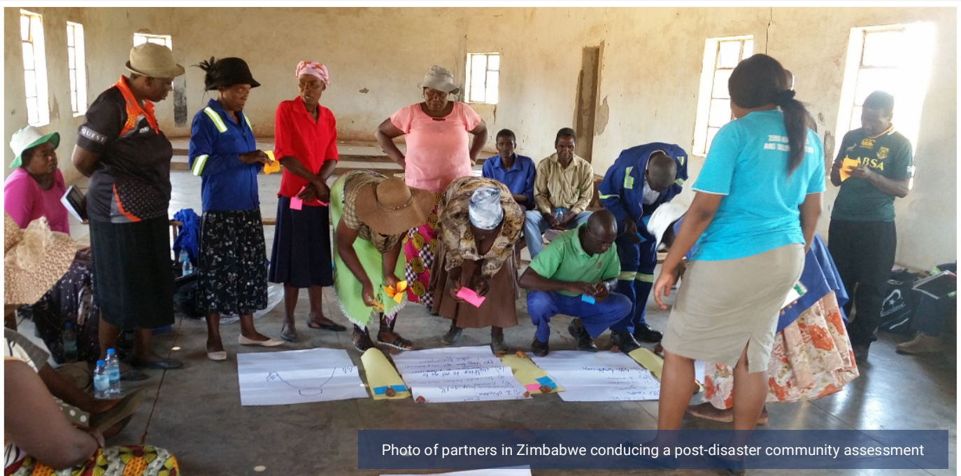
Photo of partners in Zimbabwe conducting a post-disaster community assessment