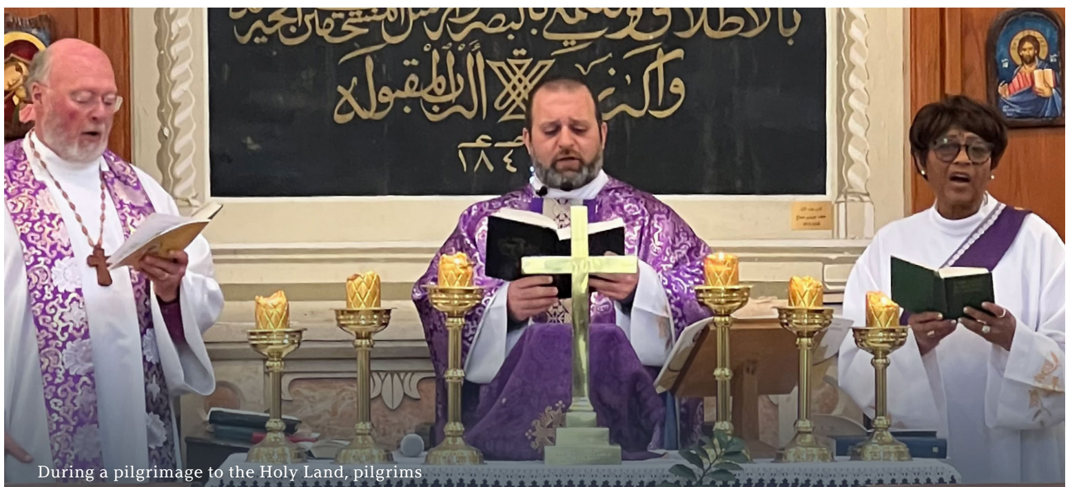
worshiped at Christ Anglican Church, Nazareth.