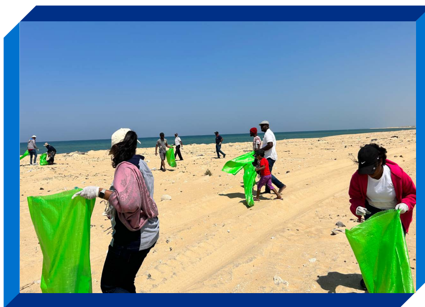
Coastal Cleaning Project conducted with the support of youth volunteers from the National Christian Council of Sri Lanka.

The Episcopal Asset Map is located here . Check your listing. If you notice something is missing or needs updated, simply click on the survey in the right-hand column and make your suggested changes. They will be forwarded to your Diocesan Map Administrator for approval, then updated!