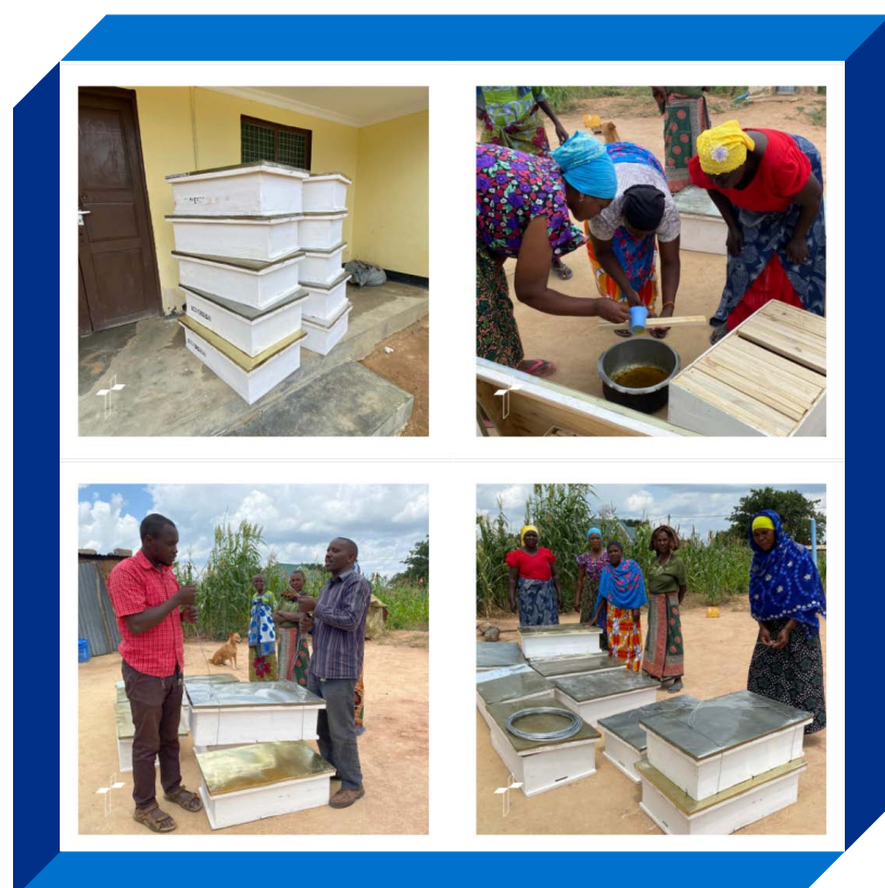
In Tanzania, Episcopal Relief & Development partners with the Anglican Diocese of Central Tanganyika to teach beekeeping as a sustainable livelihood in drought-prone communities.

How do you find out how much energy your church building consumes and translate that into your carbon footprint? Here are some options: