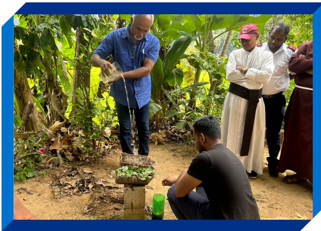
Demonstration of the resilient gardening techniques in the Central Province of Sri Lanka.