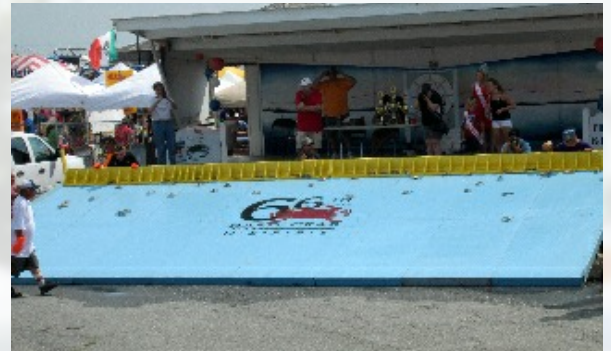
A crab representing each of the 50 states races in the Governor's Cup during Crisfield's 66 th annual Hard Crab Derby on August 31, 2013.

The Episcopal Relief & Development monies are being used for a variety of projects to assist in the recovery of residents of Crisfield and Somerset