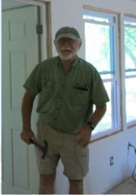
Above Photos: Joe Pinto