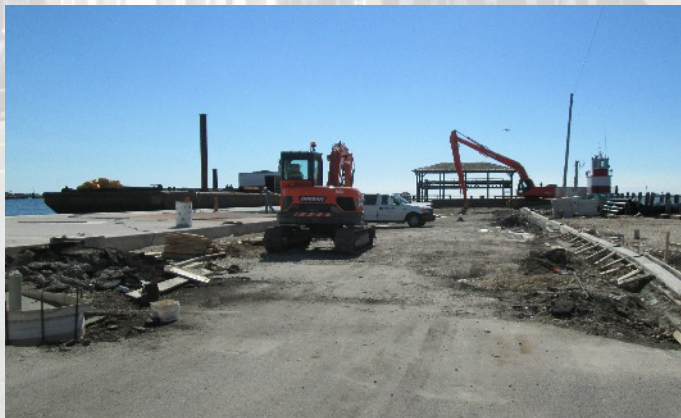
A landmark of Crisfield was the wooden pier in downtown. After extensive damage from Sandy, the pier was torn down. In an effort to keep Crisfield culture alive the city has begun to construct a new pier on the site of the old one.